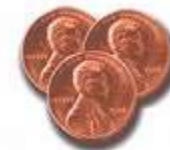
Penny 1 cent

Meals, toiletries, laundry & entertainment