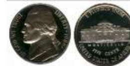
Nickel 5 cents