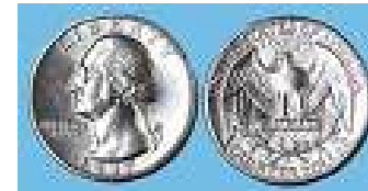
Quarter 25 cents